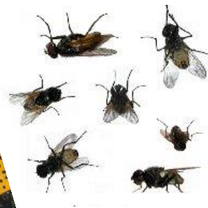
“Out, Damned Flies!”