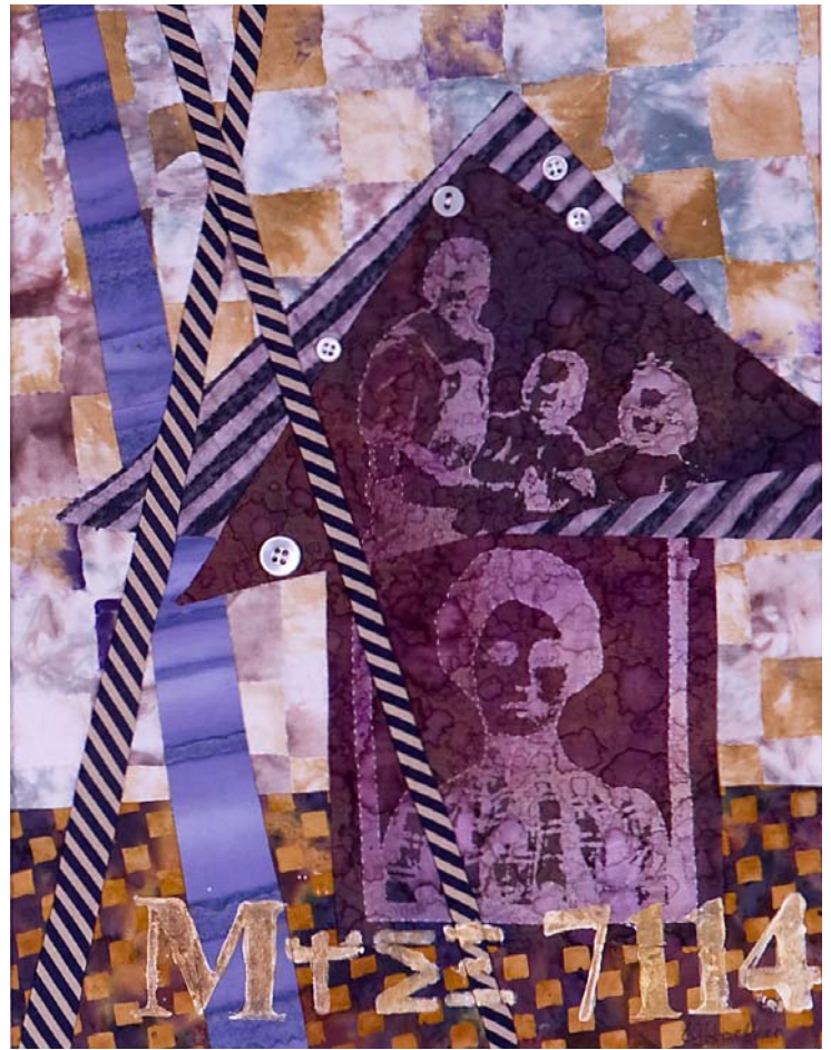
#4 - Sandra Hoefner