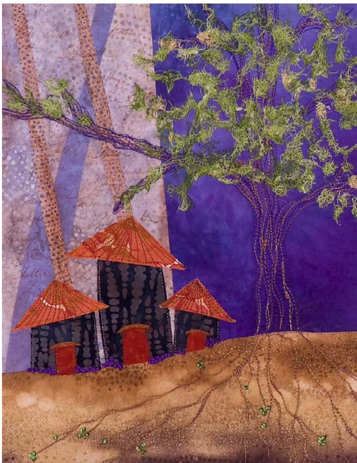
#5 - Nancy Dobson