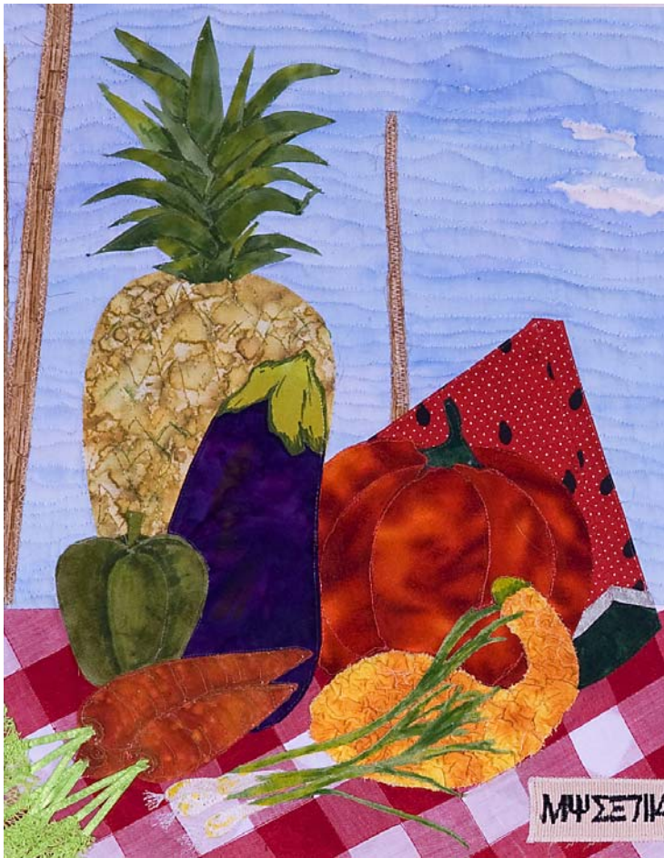
#3 - Rita Faussonne