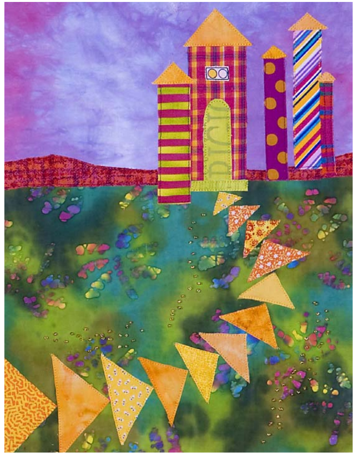
#8 - Angela Kenley