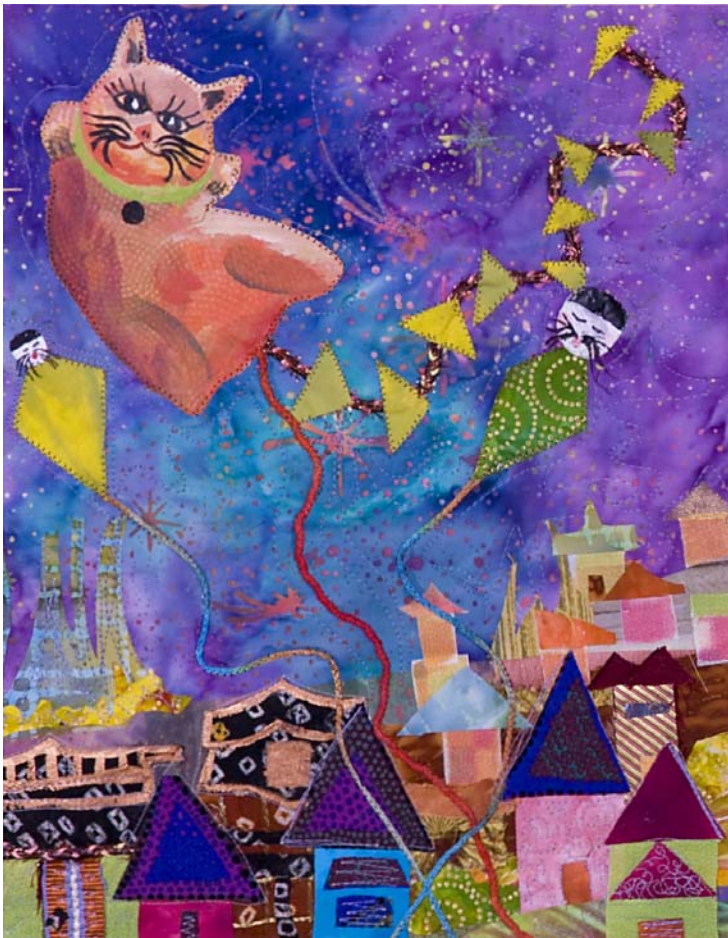
#9 - Susan Strickland